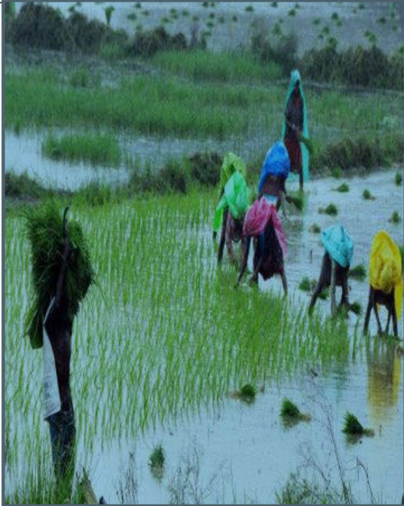
Rice Cultivation with the help of human labour