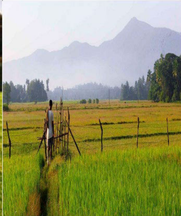
A Farm in India