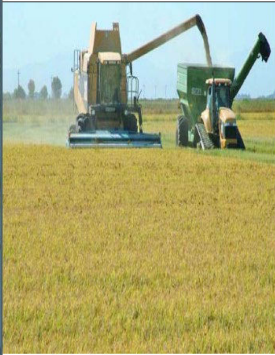
Mechanised wheat farm

Differentiate between the various types of farming according to geographical conditions, demand of production, labour and level of technology.